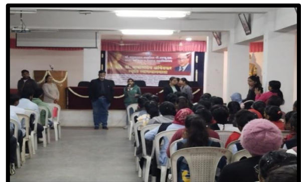
Workshop organized for B.Com Semester II students on “Advertising & Marketing” was held on 10 th Dec 2022.