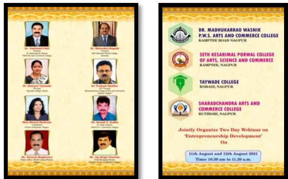
Two Day Webinar on “Entrepreneurship Development” on 11 th Aug & 12 th Aug 2021.