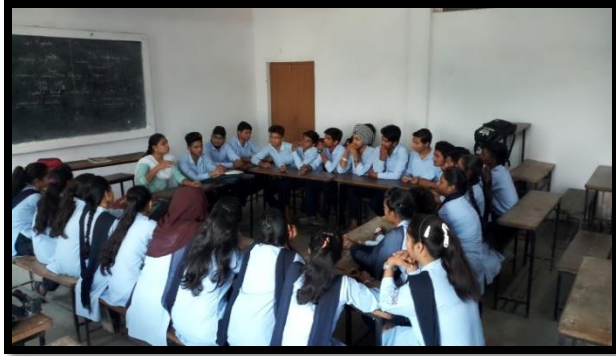
Group Discussion of B.Com IIInd Semester students on “Impact of Demonetization” were held on 8 th Feb 2020.