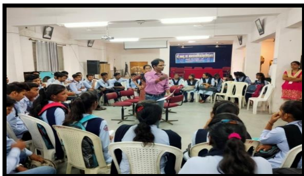
Skill Development Activity held on 21 st Sept 2019.