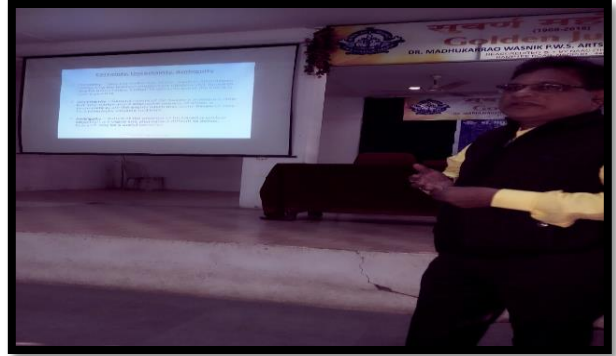
Seminar for M.Com Students on 7 th March 2020 on topic “Assets & Liabilities Management” .