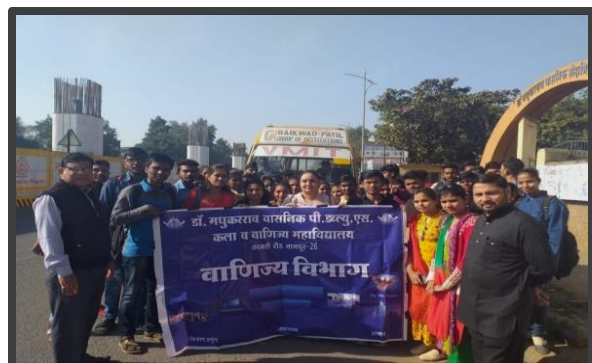
The Industrial visit was held on 19 January 2019 in Tulsiramji Gaikwad-Patil College of Engineering & Technology, Nagpur.