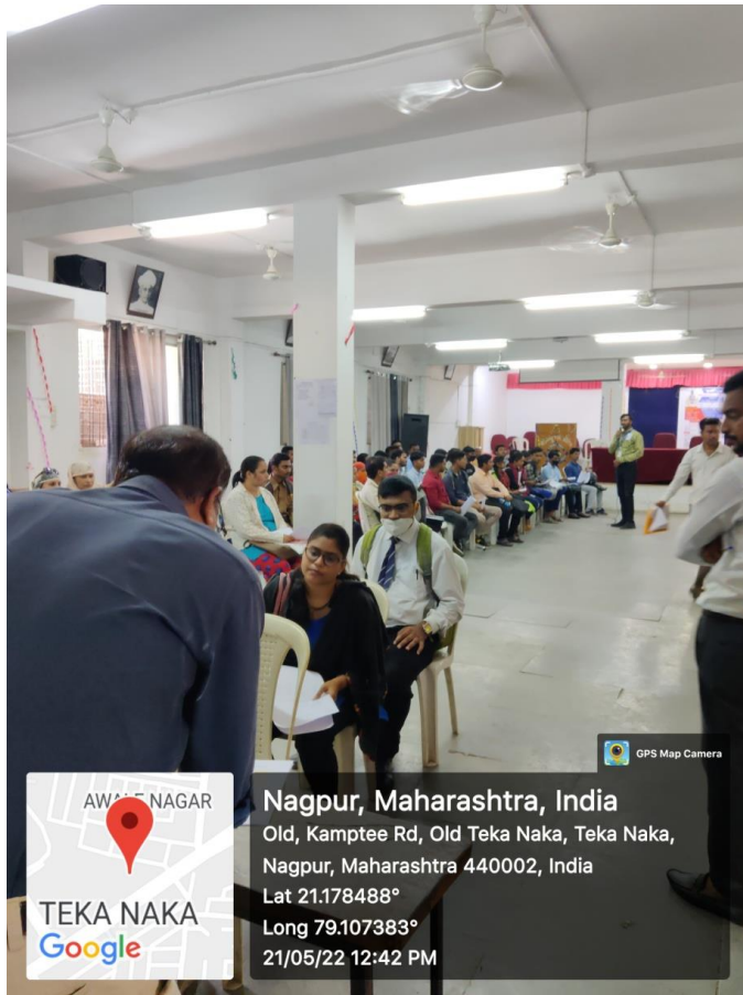
The HR of EduNxt Conducting interview of a candidate in the placement drive