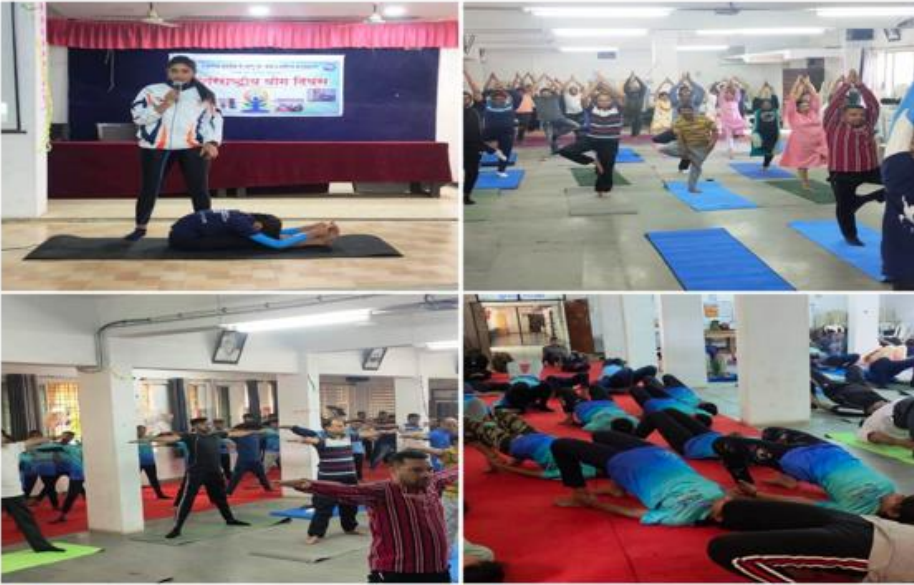
Celebrating International Yoga Day

was invited for the session who gave demonstration along with practical session to all the members who were present they also address the gathering with lecture on importance of yoga in day to day life. They also told about the with relaxation exercises and technique of breathing.