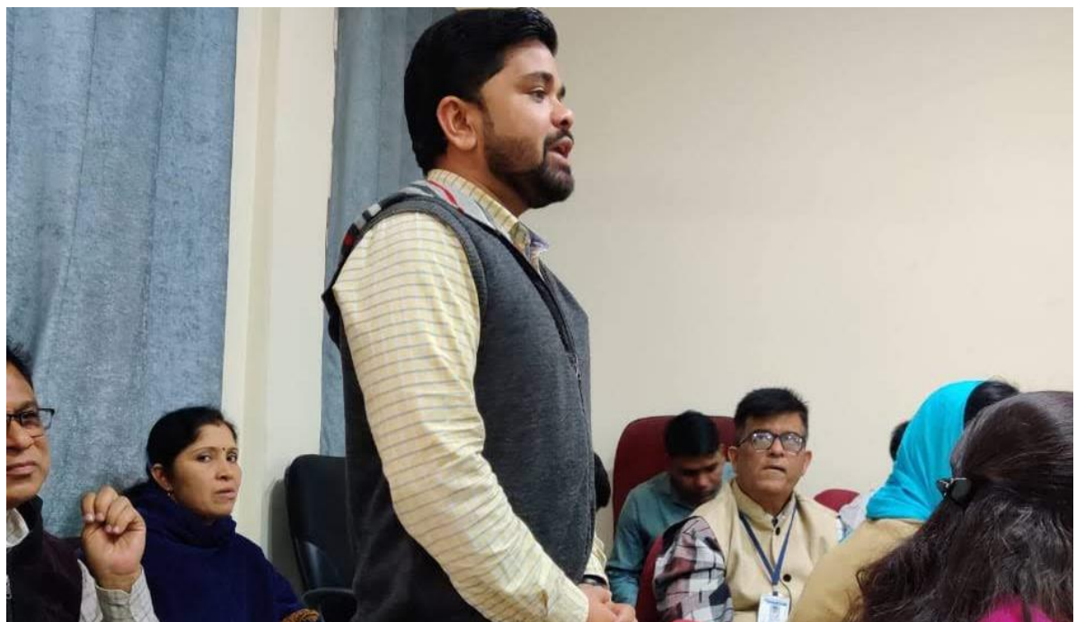
Research students putting forward their queries