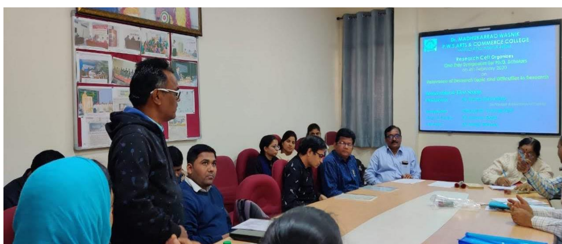
Research scholar interacting with the resource persons