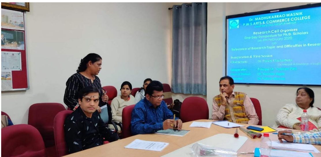
Research scholars posing their questions on hypothesis and selection of the research topic