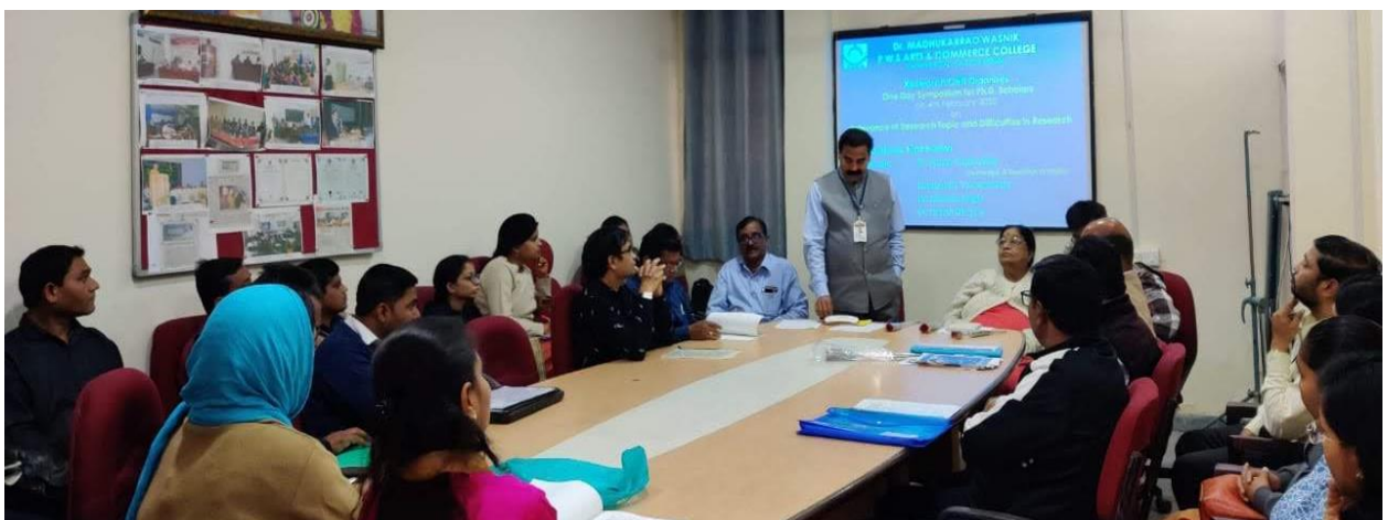
The Chairperson providing tips to the research scholars