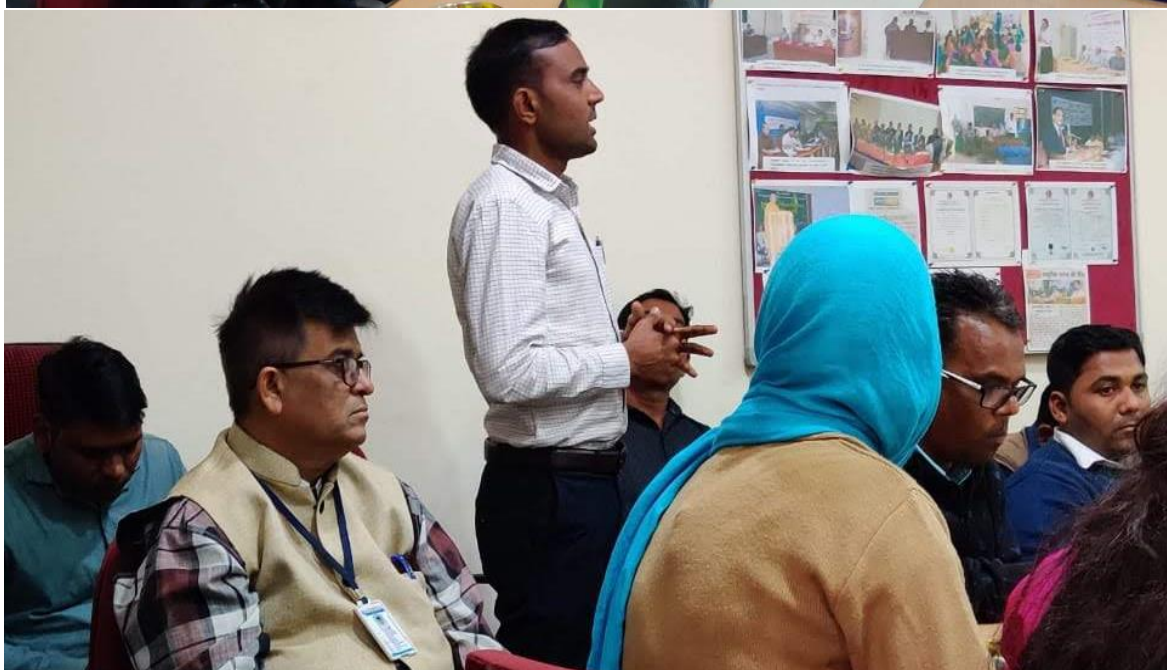
Research scholars asking about Citation and References