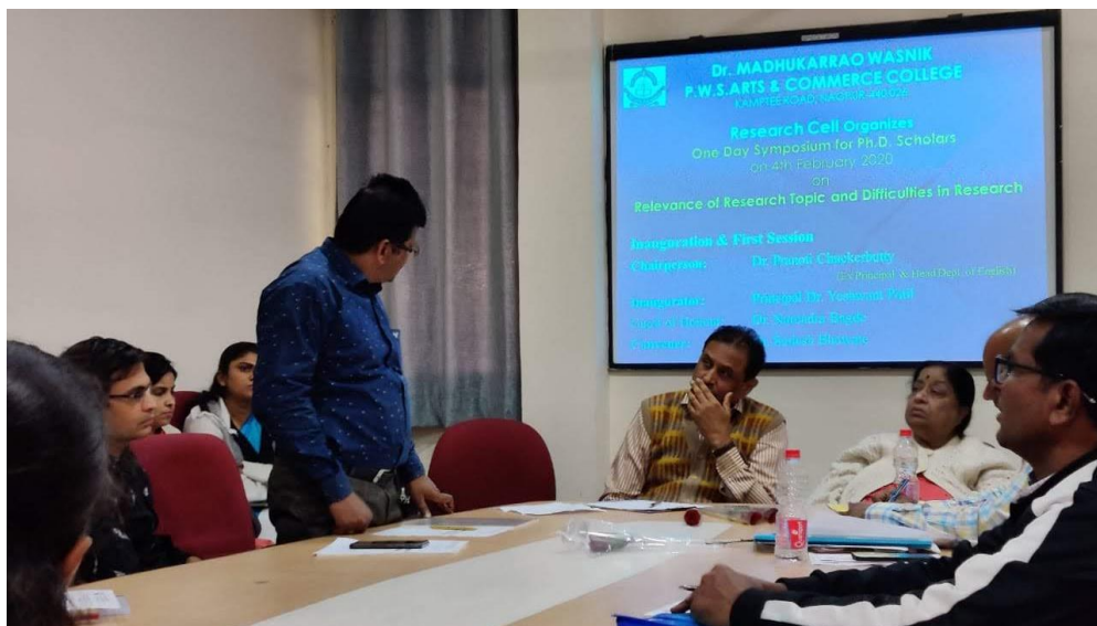
Research Scholars posing their questions