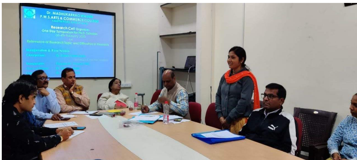
Research students asking questions about research methodology