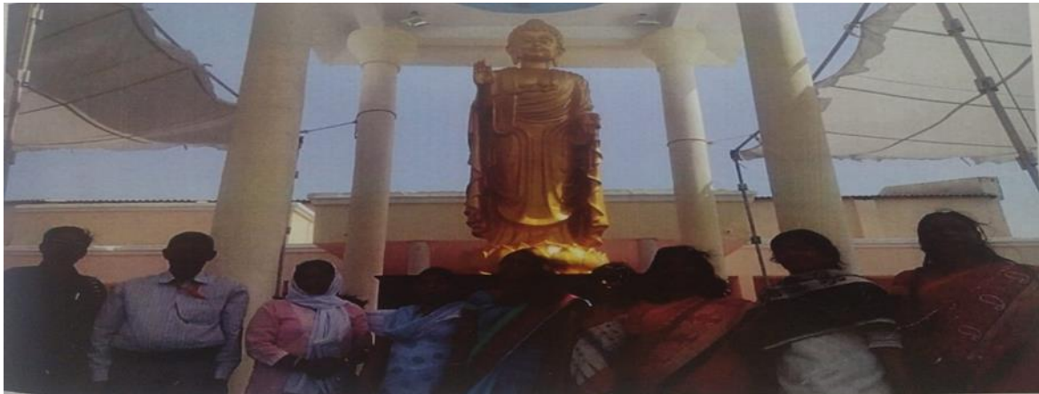
Dept. of Pali field visit to Deekshabhoomi Nagpur