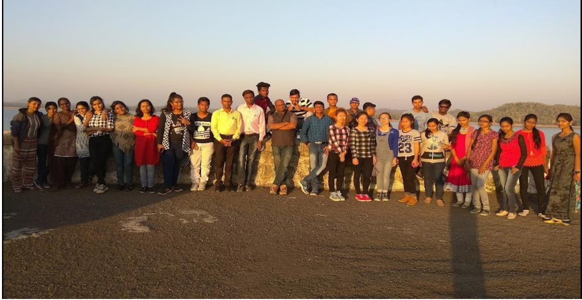
Dept. Pali Students Visited MHOW place of Dr. B.R. Ambedkar's birth