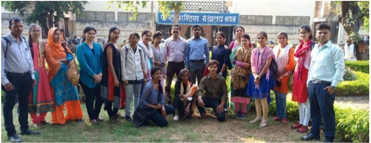
Dept. of English Excursion Tour to Mansar and Ramtek on Oct 7, 2018.