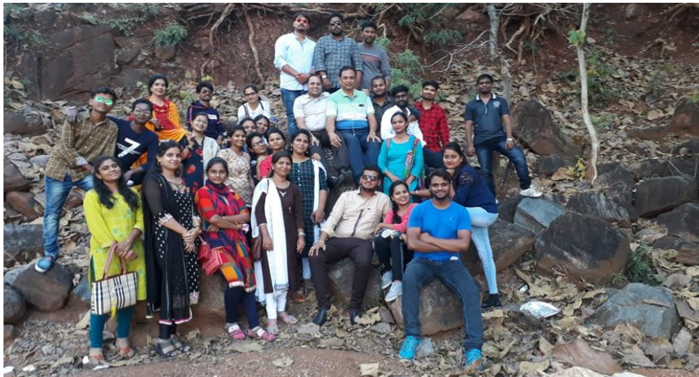
Dept. of Marasthi Excursion tour to Jain temple, Bhadaravati (23/02/2020)