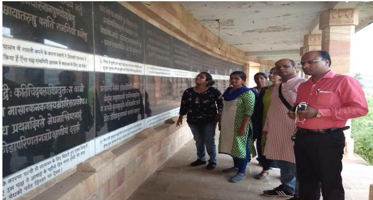
Dept. of Marathi Study Tour to Bapu Kuti Sewagram (Wardha) (19/02/2019)