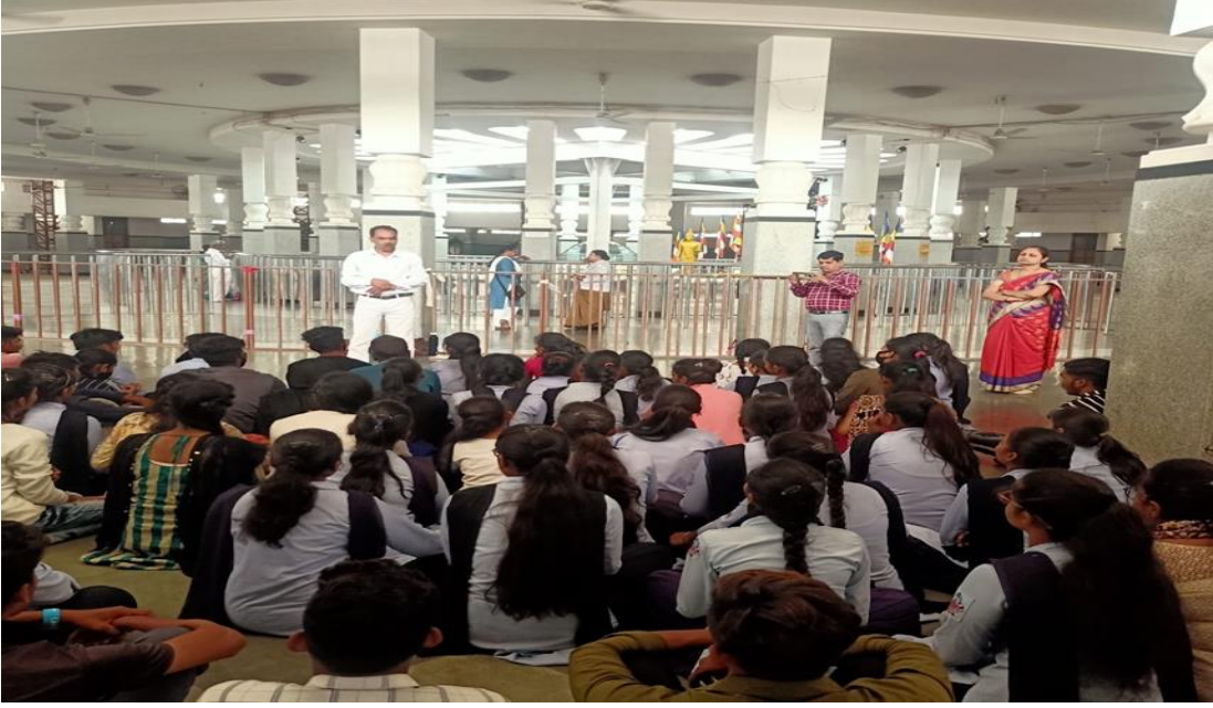
Dept. of Pali-Prakrit visit to Bajirao Sakhare E-Library, NMC Nagpur (25/02/2022)