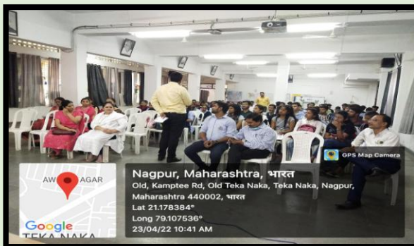
Competitive Guidance workshop Shri Harshdip Ghuge IAS Academy, 2021-22