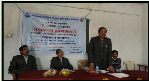
Dr. Amb.tho.Study certificate course Inauguration 2017-18